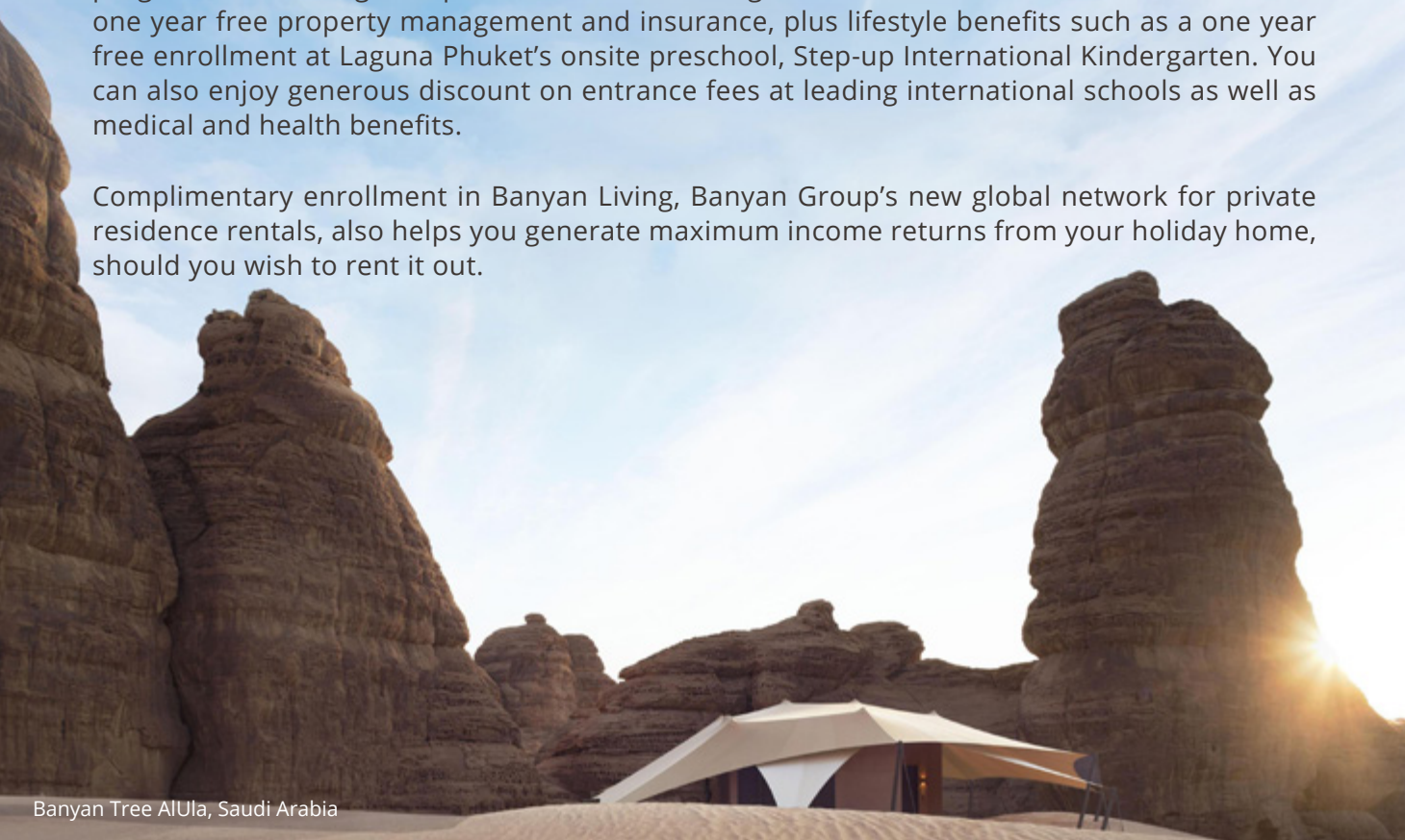
Banyan Tree AlUla, Saudi Arabia