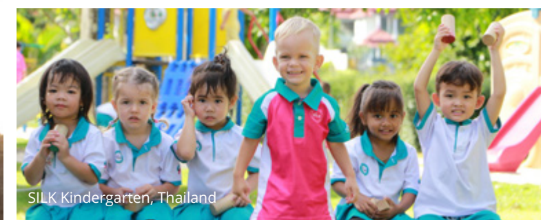
SILK Kindergarten, Thailand