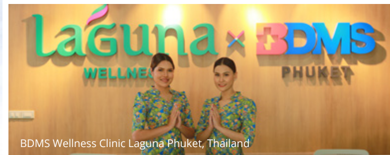
BDMS Wellness Clinic Laguna Phuket, Thailand