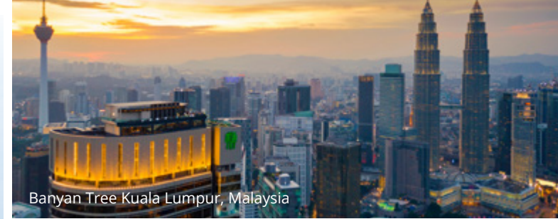
Banyan Tree Kuala Lumpur, Malaysia

Complimentary enrollment in Banyan Living, Banyan Group's new global network for private residence rentals, also helps you generate maximum income returns from your holiday home, should you wish to rent it out.