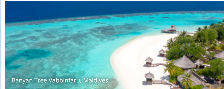
Banyan Tree Vabbinfaru, Maldives